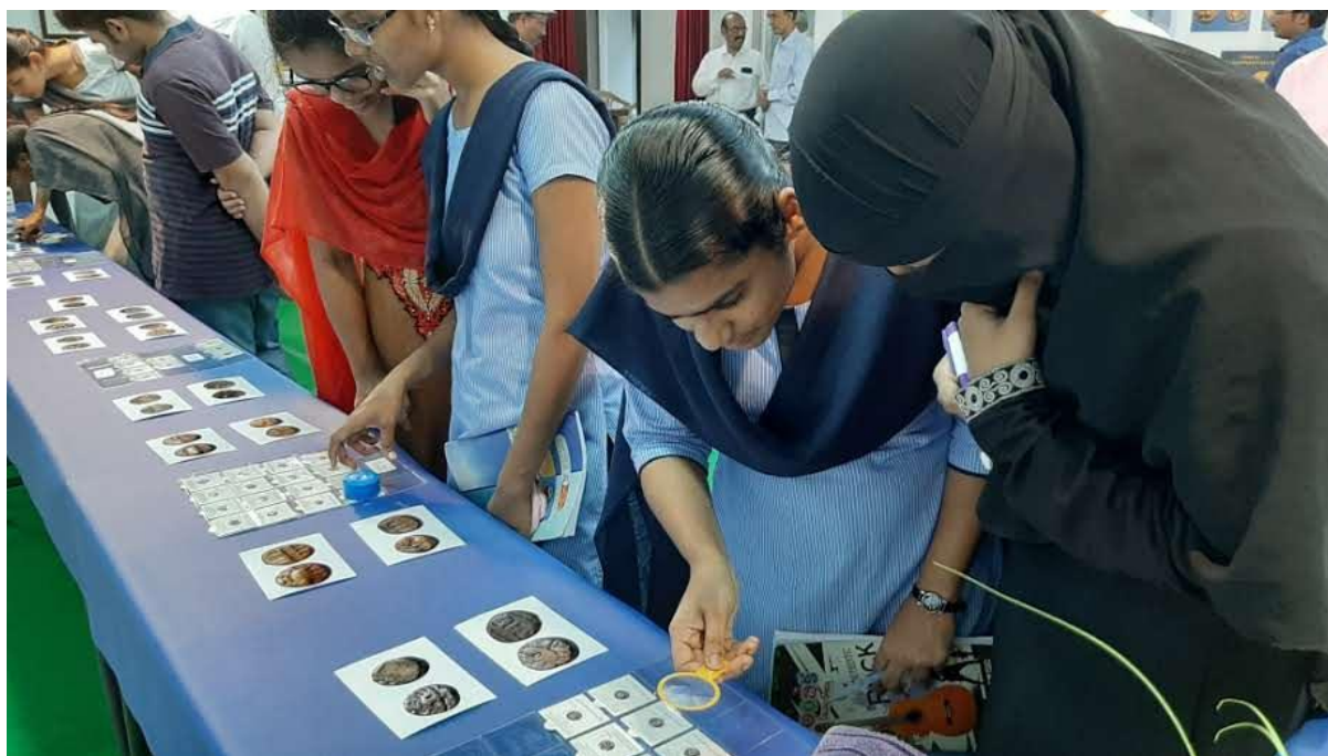
COINS OF VIJAYANAGARA EMPIRE