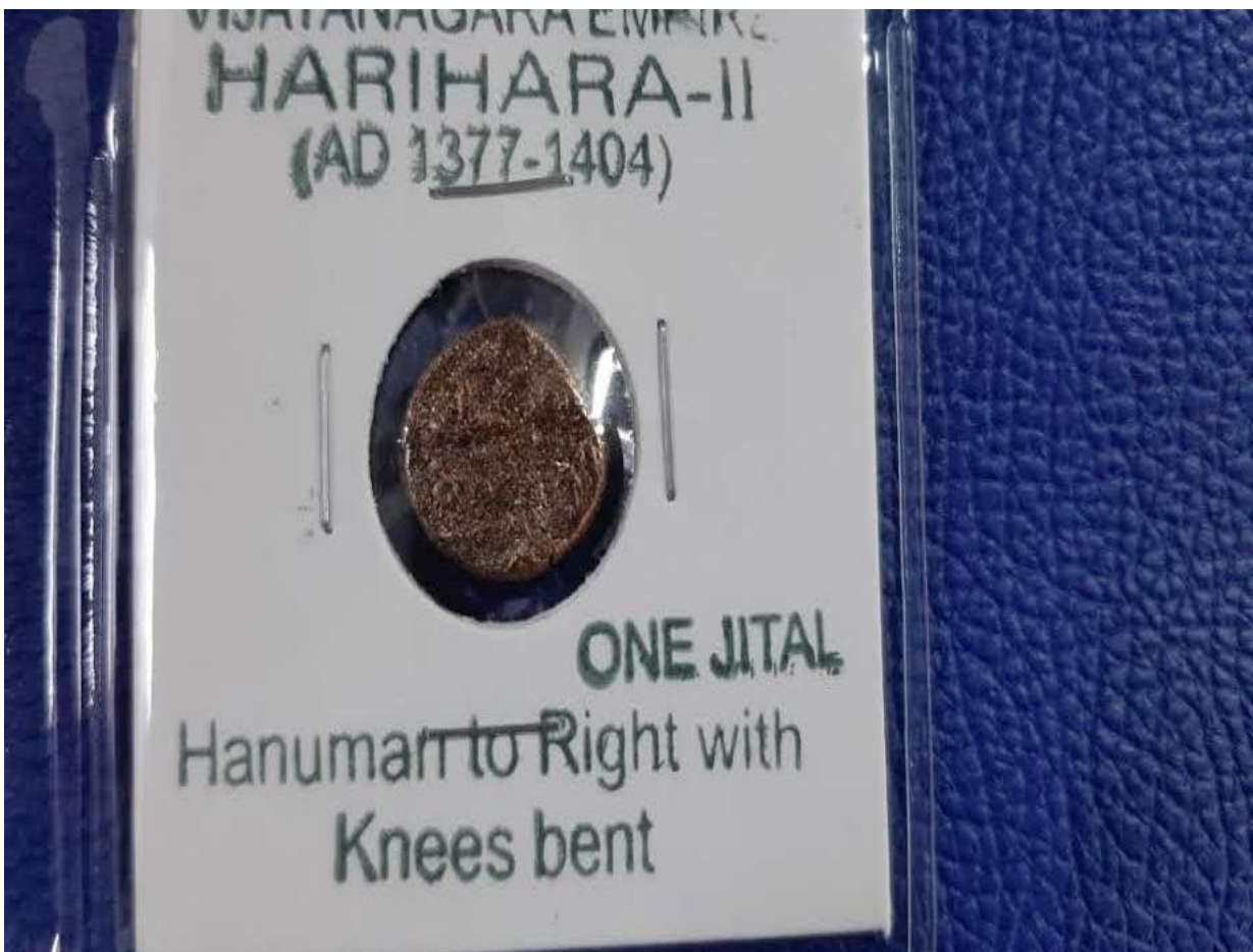
COINS OF HARIHARA RAYA