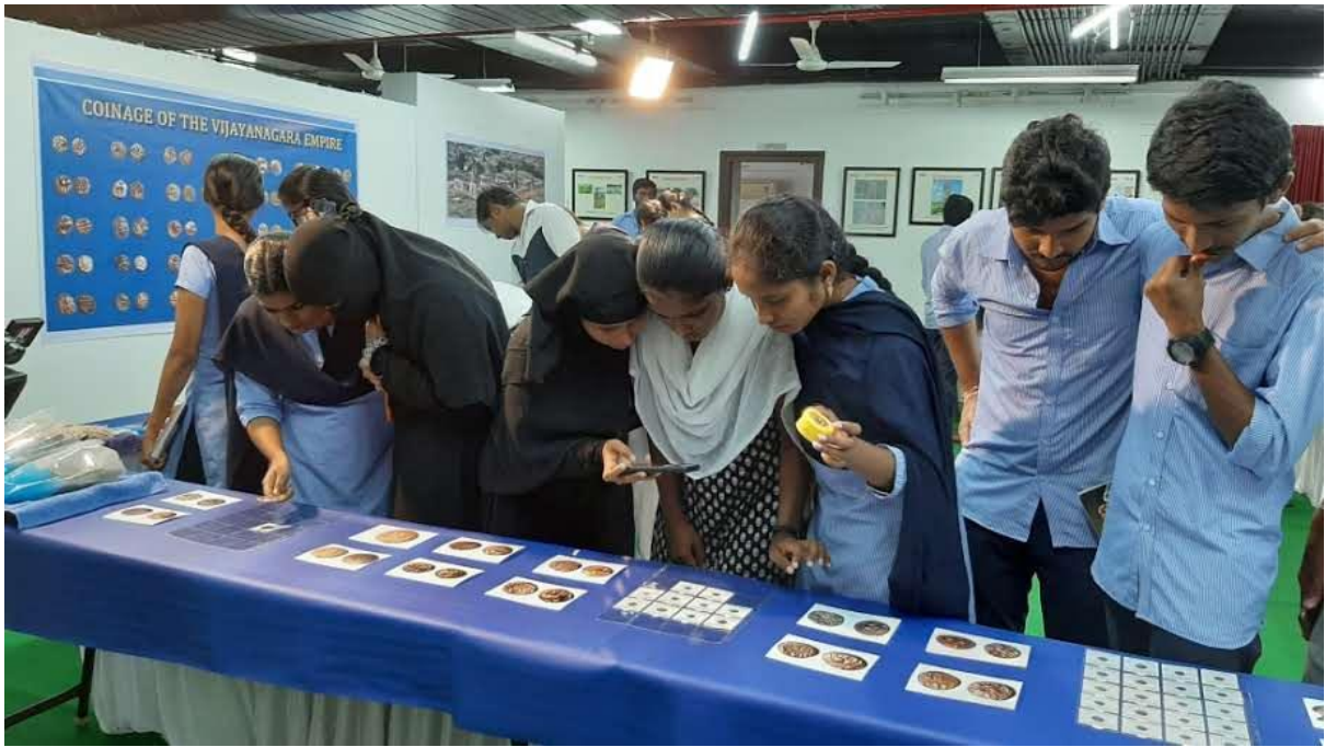
STUDENTS CURIOUSLY OBSERVING THE COINS